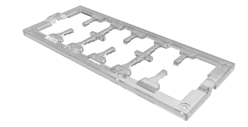
KEL12/01 - PPS BLACK STANDARD